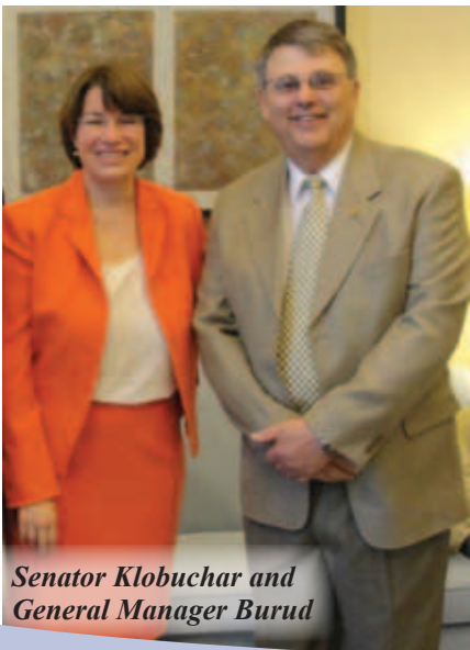
Senator Klobuchar and General Manager Burud

The "Call Before You Dig" law (Minnesota Statute 216D) requires that any excavator must call the state-wide notification center before doing any digging more than 12-inches deep at least 48 hours (excluding weekends, holidays and emergencies) prior to the start of digging. Operators of pipelines, electrical lines, telephone lines and other utilities are notified and must use color-coded markings to show the location of their lines or facilities on the site. Information needed is the type of work being done, how long the work will take and where the work site is located. The work site location also includes the legal description of the property (township, range, section/quarter). This information can be obtained from property tax statements.