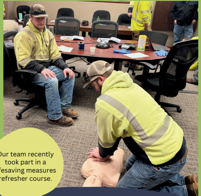
Our team recently took part in a lifesaving measures refresher course.